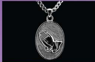
Praying Hands 36-534