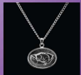
Cat Bed 36-532