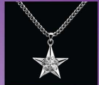
5-Pointed Star 36-536