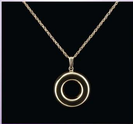
Circle 36-552 14K