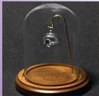
36C-498 Globe With Dog House 36-530

Glass Dome with hardwood base displays your choice of jewelry pendants