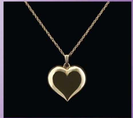
Large Heart 36-553 14K