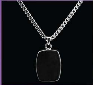
Plain for Engraving 36-537