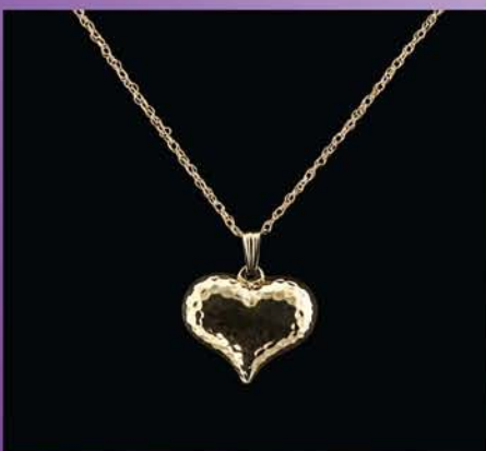
Hammered Heart 36-554 14K