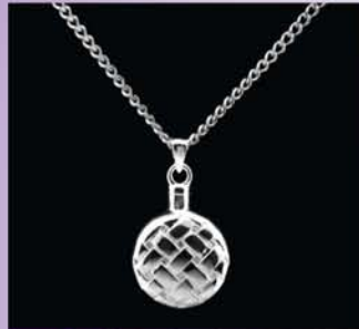
Flask Quilted 35-542