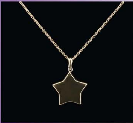
Flat Star 36-5513 14K