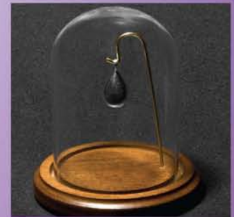
36C-498 Globe With Tear Drop 36-526