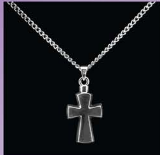
Stylized Cross 36-518