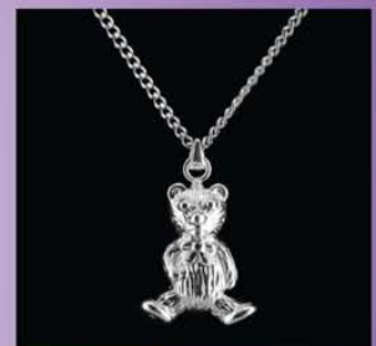
Teddy Bear 35-524