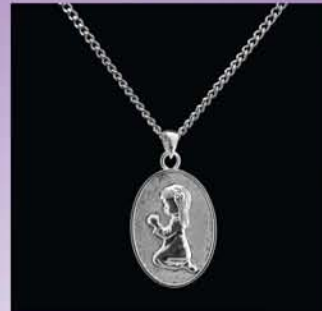
Girl Kneeling 36-519