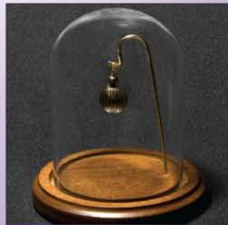
36C-498 Globe With Ribbed Ball 36-506