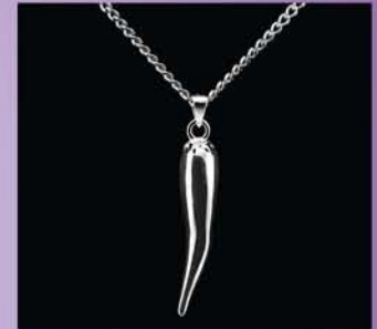
Italian Horn 35-544