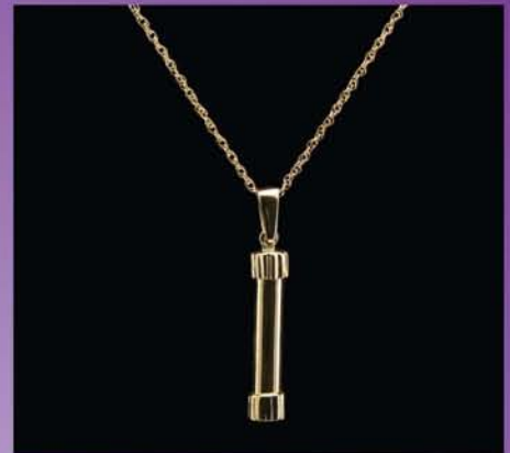
Cylinder Pendant 36-504 14K