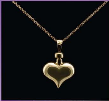
Heart 36-503 14K