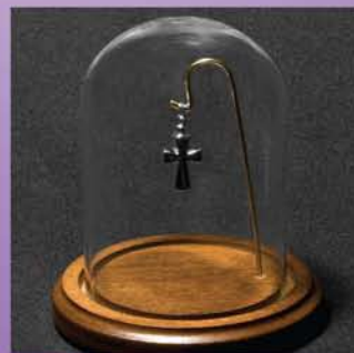
36C-498 Globe With Stylized Cross 36-518