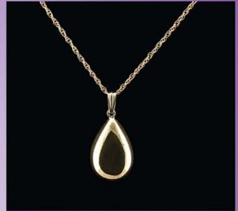
Teardrop 36-550 14K