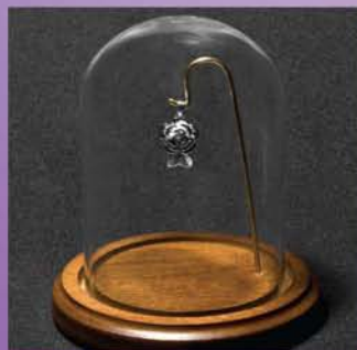
36C-498 Globe With Peony 36-517