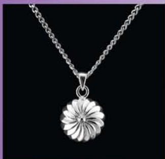
Spoked Wheel 36-521