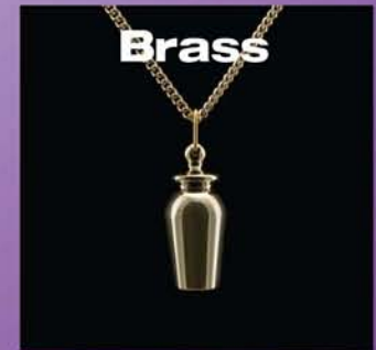
Forever 36-500 Brass on 22" Chain