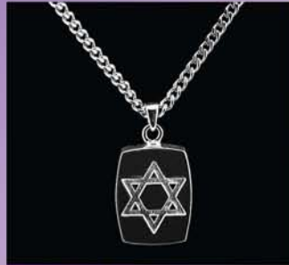
Star of David 36-538