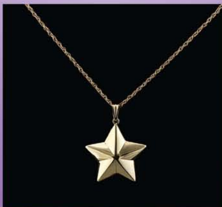
Shaped Star 36-555 14K

As shown on cover displayed in Glass Globe