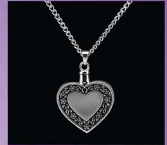
Heart Antique Border 36-540