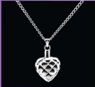
Heart Quilted 35-541