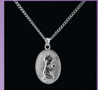
Boy Kneeling 36-520