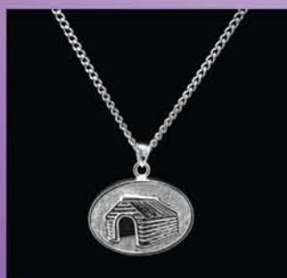
Dog House 36-530