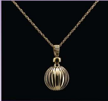
Ribbed Ball 36-506 14K