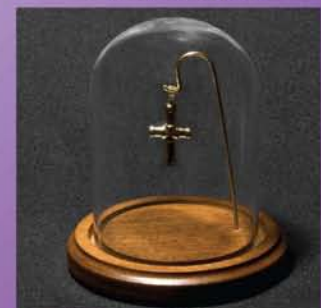
36C-498 Globe With Cross Pendant 36-505

As shown on cover displayed in Glass Globe