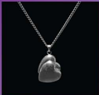
Companion Heart 35-512