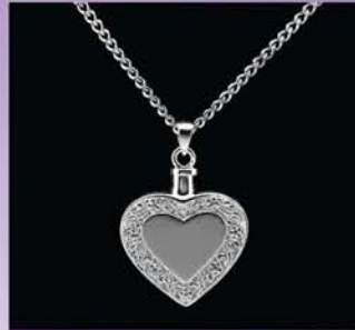
Heart with Border 36-539