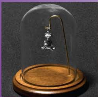
36C-498 Globe With Teddy Bear 36-524