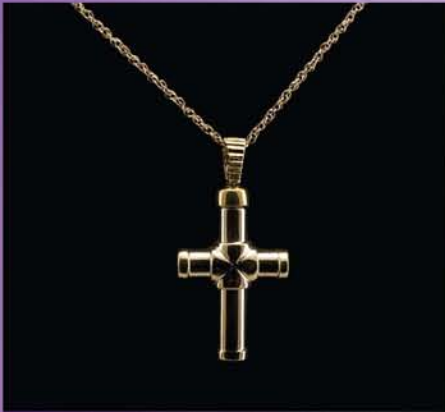
Cross Pendant 36-505 14K