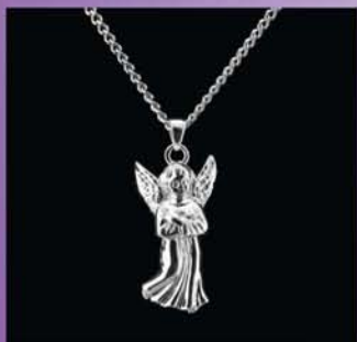
Guardian Angel 36-525